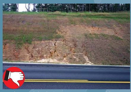
Poor seed establishment on slope. Use seeding in combination with other BMPs (e.g. erosion control blankets) when slopes are steep.