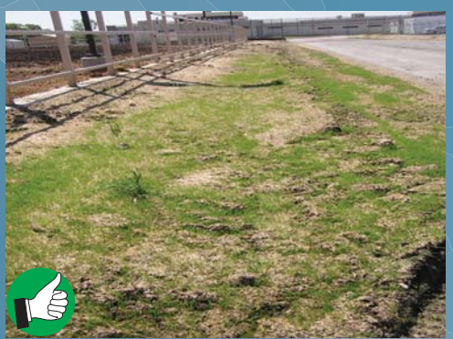
Mulch is applied to reduce sediment runoff. Mulch needs to be applied regularly in high traffic areas to maintain uniform thickness.