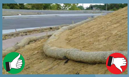
Appropriate use of a series of organic filter tubes to protect a slope; however, accumulated sediment must be removed.