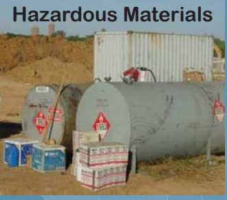
About this Guide

This guide is intended to equip the construction site superintendent with the knowledge and resources necessary to help keep the site compliant and protect water quality from stormwater pollution due to soil loss and mismanagement of materials and waste. It provides basic information of common BMPs used at construction sites related to: