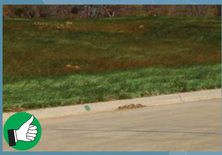
Replacement vegetation is being used effectively as a temporary control.