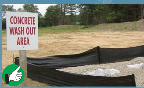
Signage is used properly to identify the concrete washout area.

Concrete washouts are used to contain concrete and liquids when the chutes of concrete mixers and hoppers of concrete pumps are rinsed out after delivery. The washout facilities consolidate solids for easier disposal and prevent runoff of liquids. Concrete washouts may consist of an approved build structure or a prefabricated container.