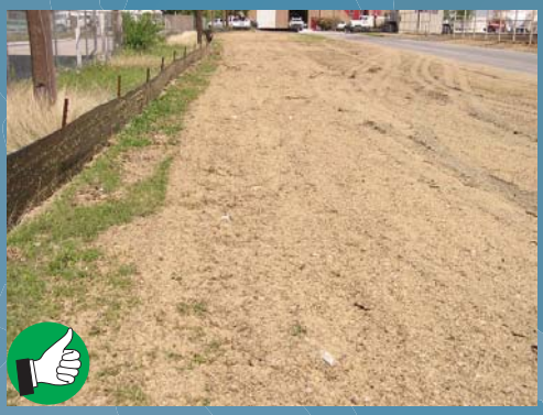
Mulch is applied with seeding for final stabilization.

Mulching is the application of a uniform layer of organic material over barren areas to reduce the effects of erosion from rainfall. Types of mulch include compost mixtures, straw, wood chips, bark, or other fibers.