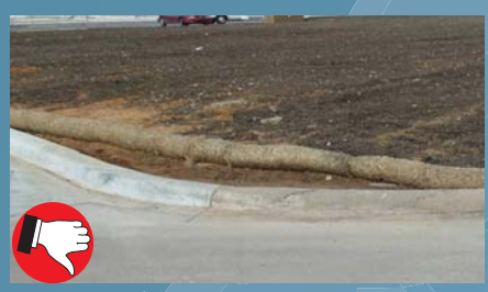
Inadequate organic filter tubes to protect this area of exposed soil; additional BMPs are needed. Tubes need to be re-aligned at the curb and appropriately embedded into the soil.