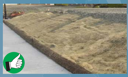
Organic filter tubes are used with other BMPs to protect an area that may prevent the embedment of other controls.

Organic filter tubes are comprised of an open weave, mesh tube that is filled with a filter material (compost, wood chips, straw, coir, aspen fiber, or a mixture of materials). The tube may be constructed of geosynthetic material, plastic, or natural materials. Organic filter tubes are also called wattles, fiber rolls, fiber logs, mulch socks, and/ or coir rolls. Filter tubes detain flow and capture sediment as linear controls along the contours of a slope or as a perimeter control down-slope of a disturbed area.