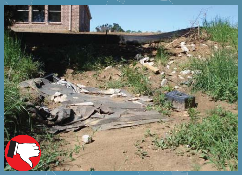
Debris and trash are not being managed through appropriate practices. Disposal receptacles and education about proper use must be provided.