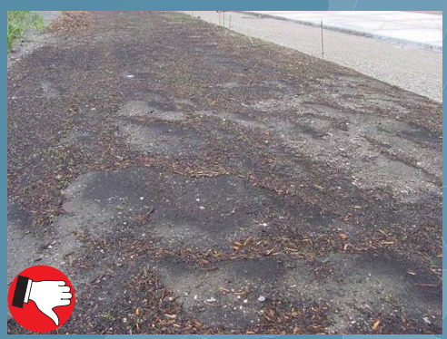
Mulch was applied in an area of concentrated flow and is washing away. Mulch should be applied evenly and uniformly and at an appropriate thickness.